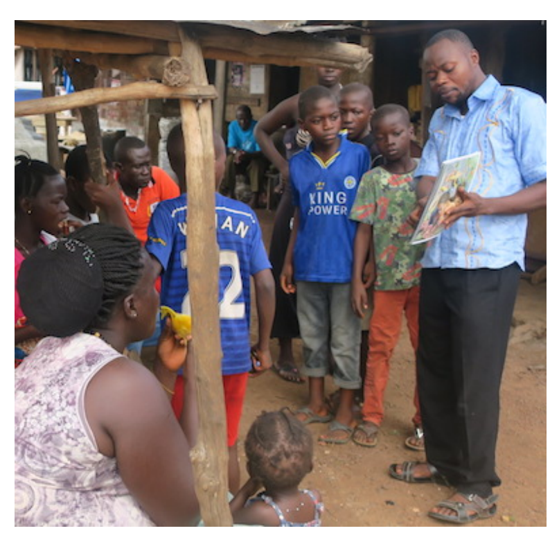
Mine eye affecteth mine heart (Lam 3:51)

From Top Left: The man in white is a devout Muslim and became quite belligerent toward to woman church worker (foreground) who offered him a tract. The pastor quickly stepped in with the wordless evangelism book. The illustrations so captivated him that he politely listened and didn't notice the group gathering around to hear the Old Story. When all was finished he was smiling, friendly, and promised to read the John/Romans booklet along with the tract. This is one of the areas where follow up visits are being made and prayerfully the church workers will engage this man again.