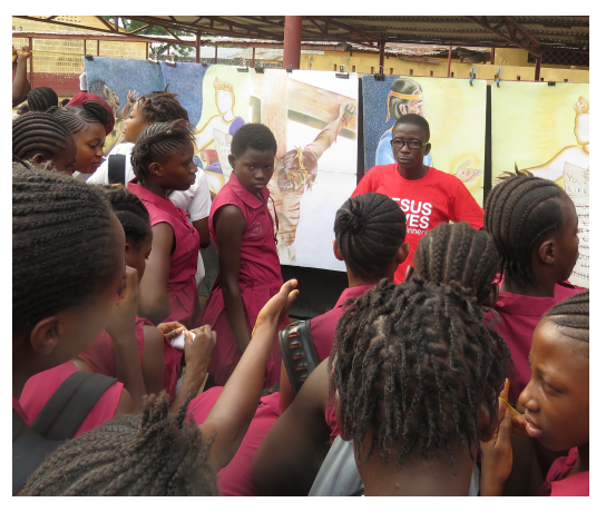
Patiently answering questions