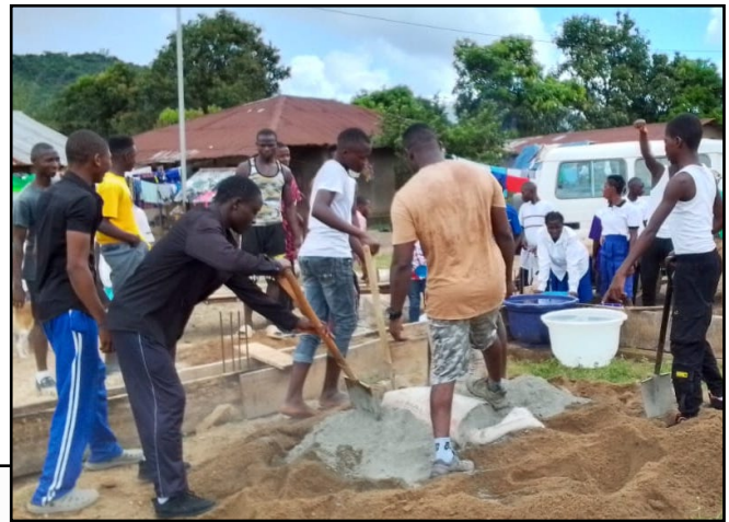
Above: Concrete is mixed and poured by hand by the school boys.