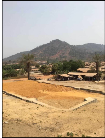
At left and below: The original 40'X80' foundation was hand poured in 2020