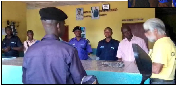
Above: Police post