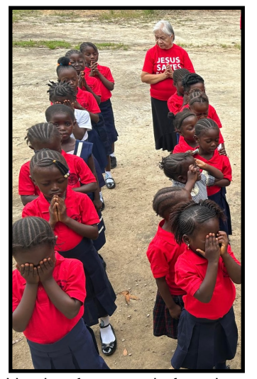
Lined up for prayer before class