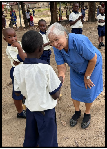
Learning new names