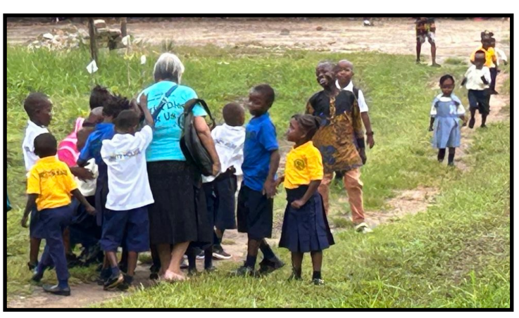
The students are excited to walk their new teacher to school!