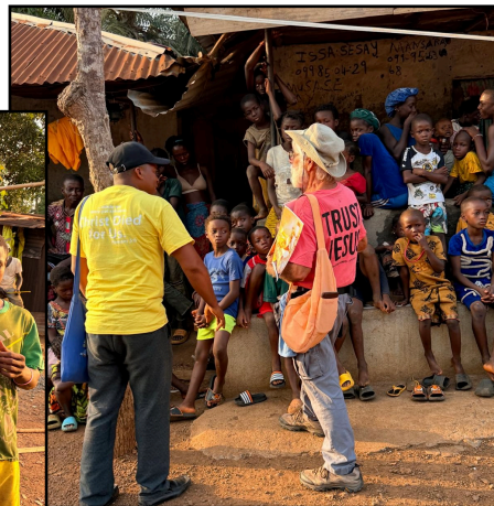
Right: two men from other churches helping in the evangelism crusade