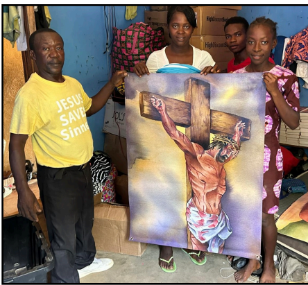
Delivering a set of banners