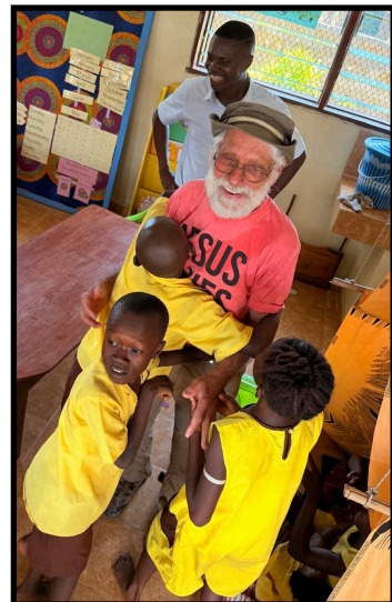
Some very grateful special needs children!